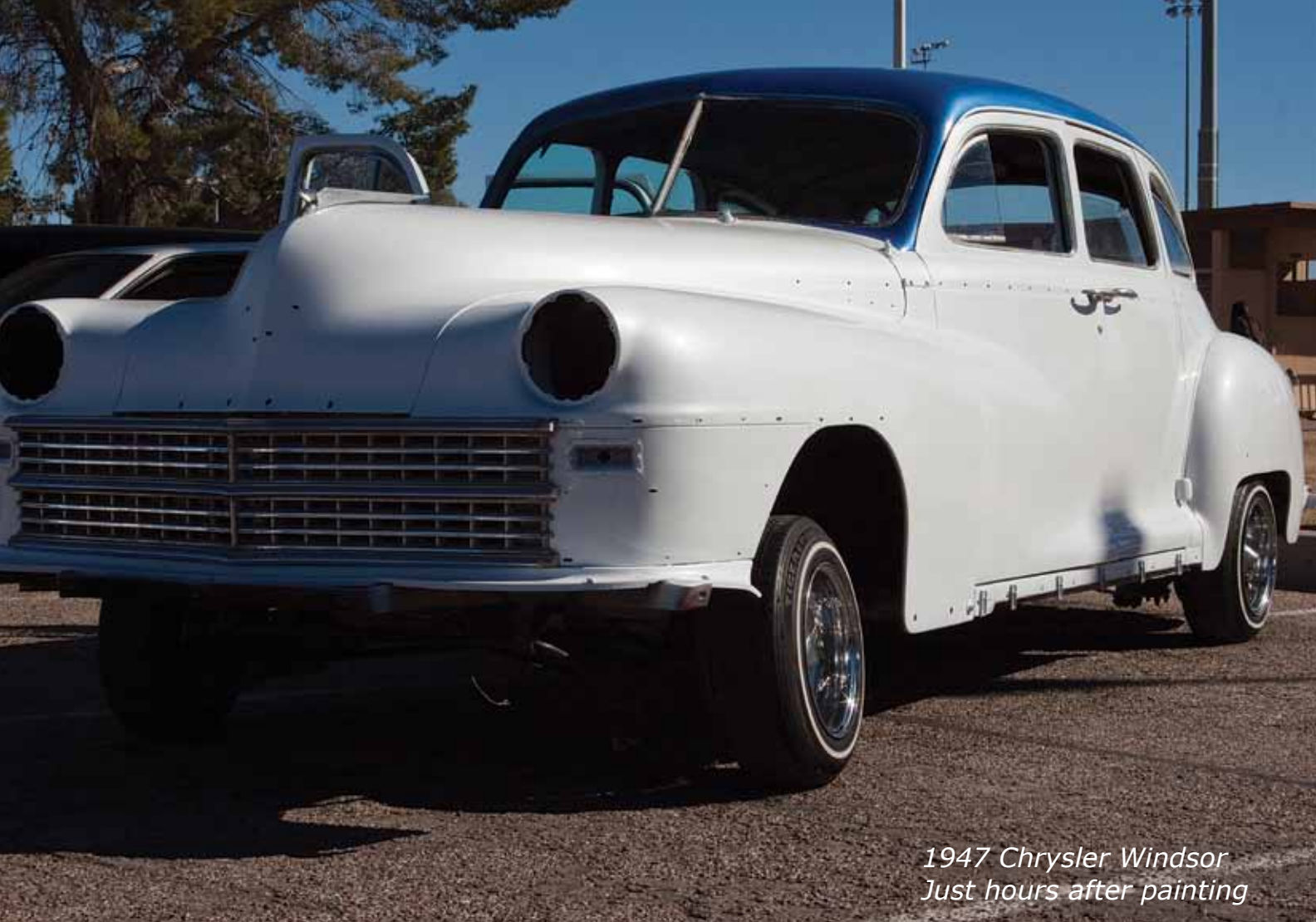
1947 Chrysler Windsor Just hours after painting